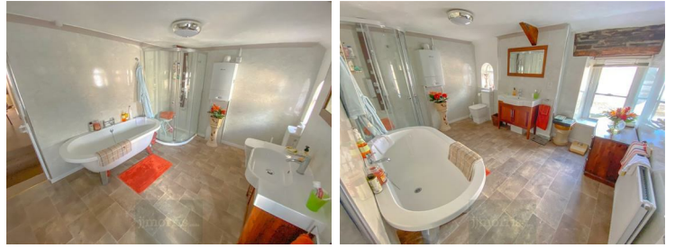
Worcester boiler, low flush WC, corner shower, vanity, roll top bath, double glazed window, feature stained glass window, radiator.