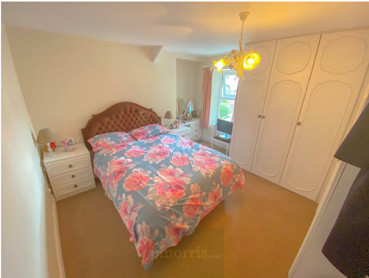
Upvc double glazed window to the rear.