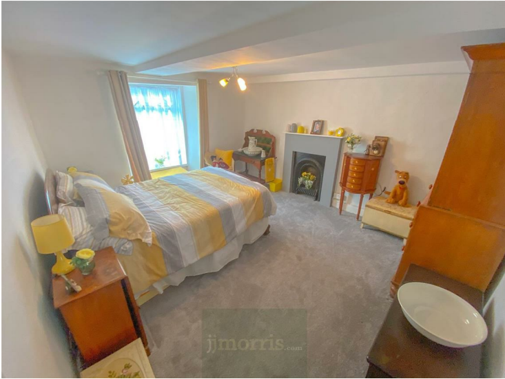
Double glazed window to the front, cast iron fireplace.