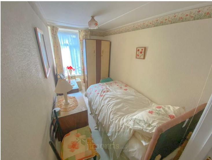
Double glazed window to the front.